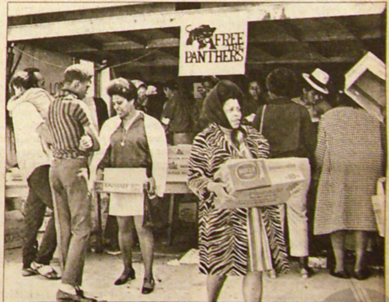
BPP Free Food program in operation in Bayview-Hunters Point area in 1969.

The Black community in BV-HP is one of the most economically depressed areas of San Francisco. Over 25 per cent of the people in the district, which is 66 per cent Black, make less than $4,000 a year. Almost 60 per