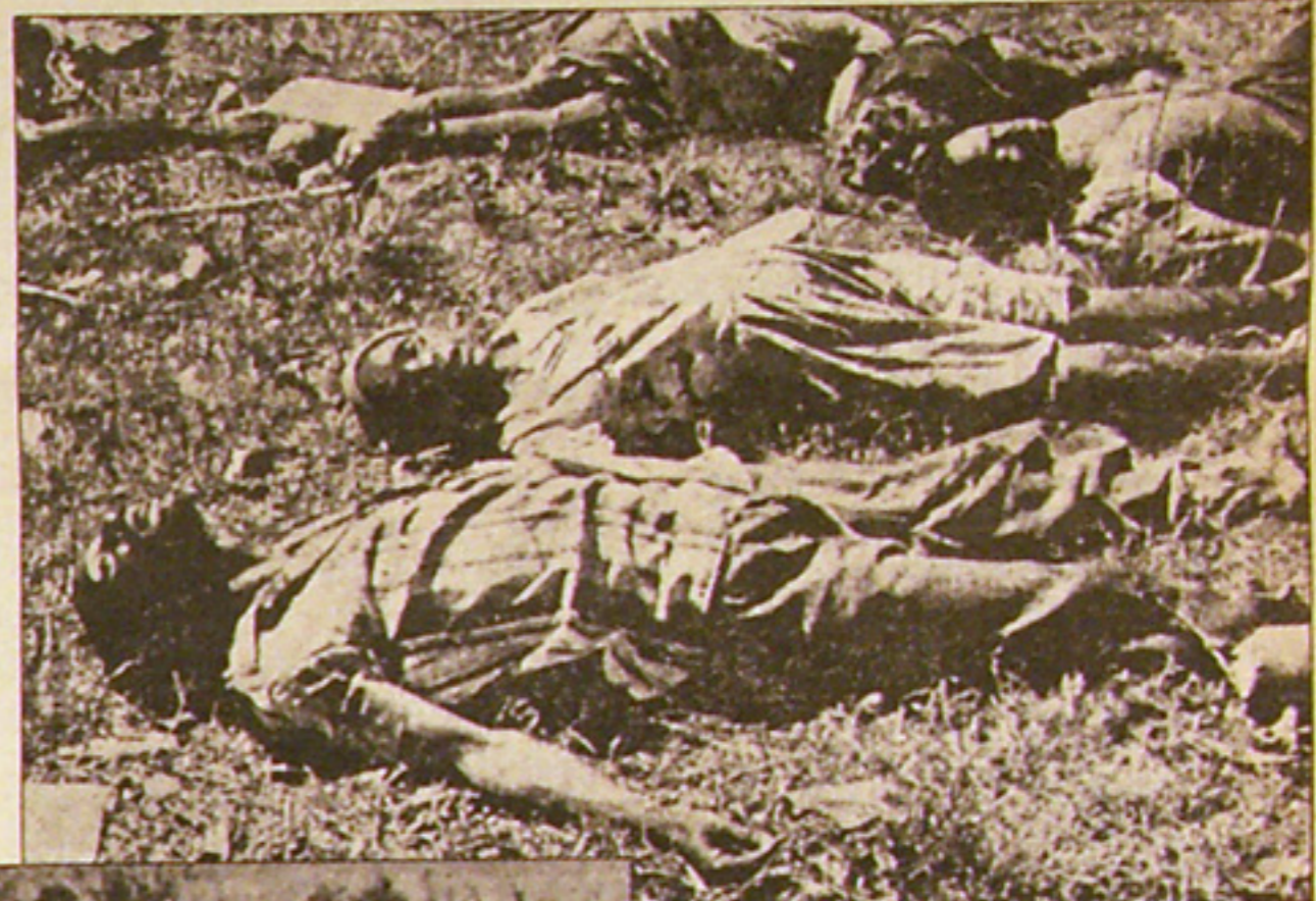
Bodies of Zimbabwean farm workers (above), murdered last week by Black Rhodesian Army troops, lie outside their burned thatch-roofed homes (left).

Following two and one-half hours of talks here last Sunday with U.S. Ambassador to the United Nations Andrew Young and British Foreign Secretary David Owen, Patriotic Front leaders Robert Mugabe and Joshua Nkomo denounced the Anglo-American plan for establishing a neutral international