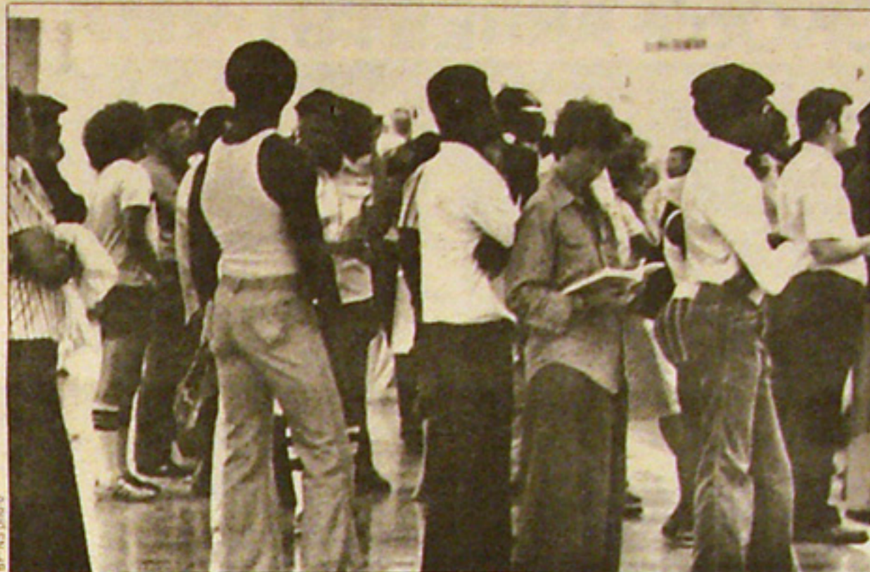
Long lines in Oakland unemployment office. Over 20,000 people are jobless in the city.

The depressing trend in unemployment nationally does not explain why Oakland should be almost doubly depressed. Unlike the country as a whole, Oakland has not experienced a large increase in its workforce. In fact, according to the U.S. Census Bureau, there are 36,897 fewer people in Oakland today than in 1960.