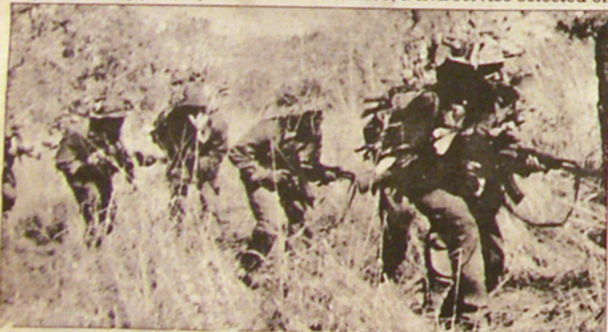
Regardless of the outcome of the bogus Rhodesian elections, Zimbabwean freedom fighters will end White minority rule.

The Unifying Force, which has expressed sympathy for the U.S.-British plan, maintains that compromise measures will not satisfy the demands of Black nationalists and that it is possible for Rhodesian Whites to live under Black rule. □