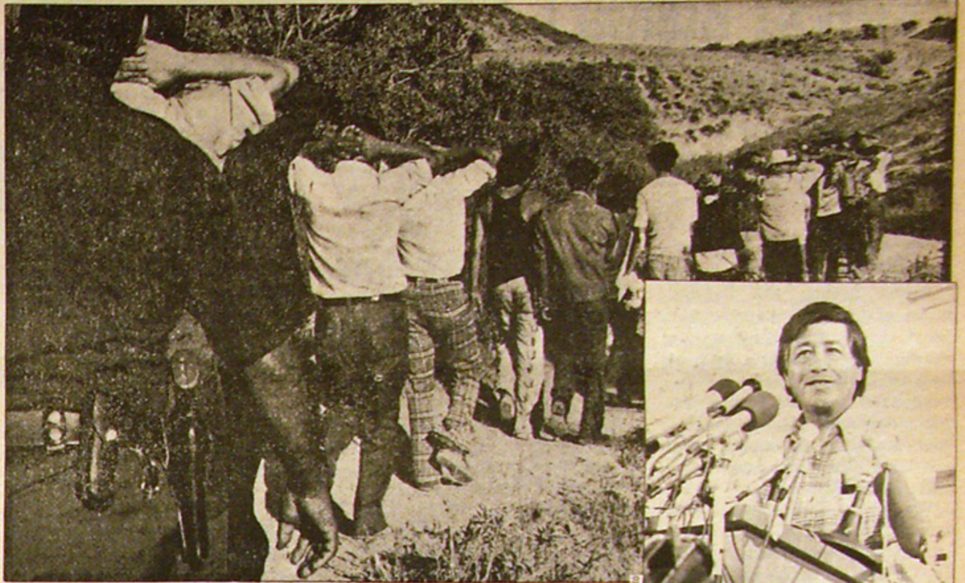
UFW President CESAR CHAVEZ (right) and border patrol cop (above) taking undocumented workers into custody.

The Committee's organizing efforts have gained widespread support from such prominent Black community representatives as: Congressman Ron Dellums; CONTINUED ON PAGE 8