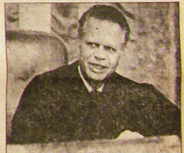
Oakland Mayor LIONEL WILSON, a former county Superior Court judge.

•Increasing prison sentence terms by as much as 75 per cent more than presently allowed