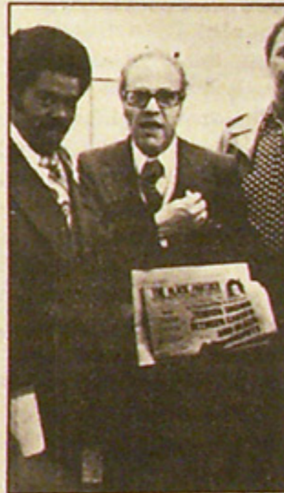
NAACP Executive Director BENJAMIN HOOKS reads THE BLACK PANTHER.