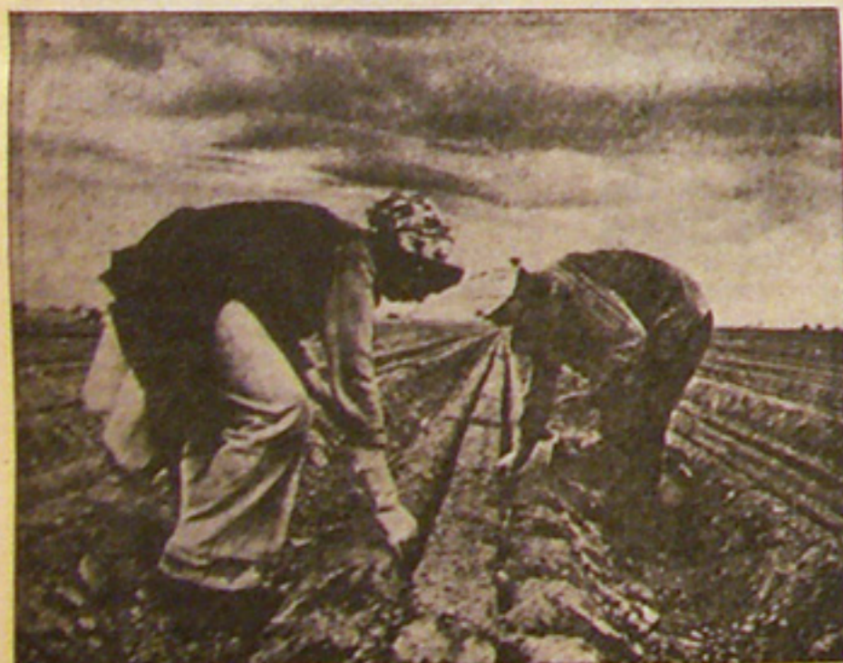
The UFW, seeking to uphold the rights of farm workers, is expanding its influence nationwide.