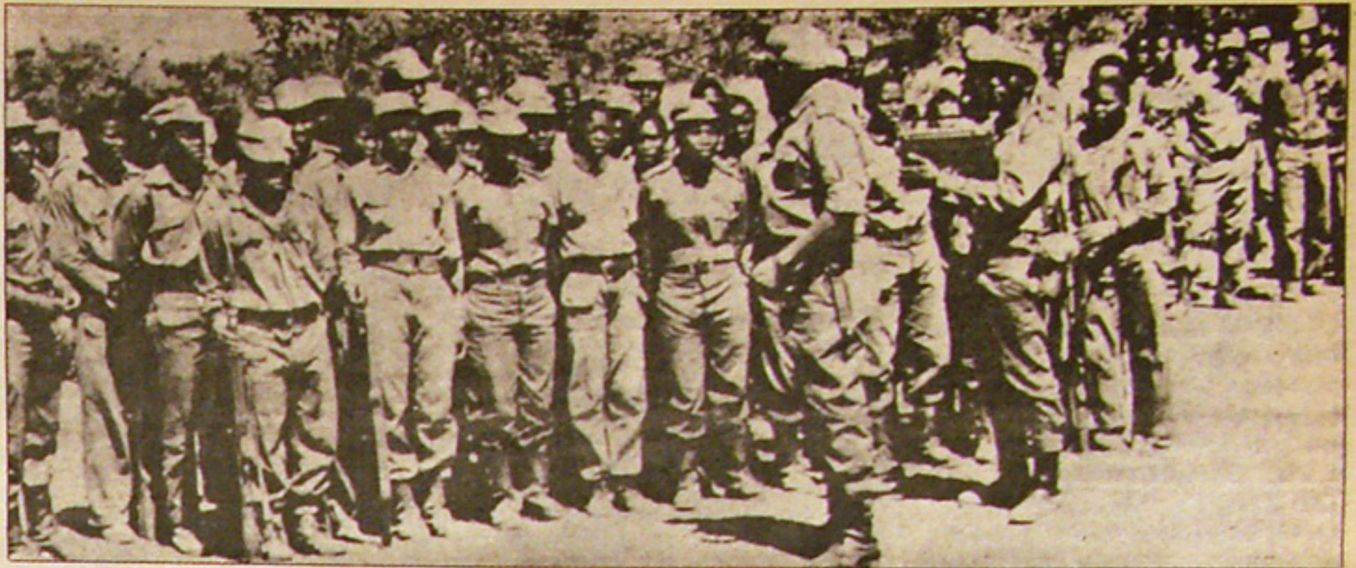
SWAPO militants in Namibia during military briefing.

The French minister abruptly cancelled his visit to Tanzania two weeks ago when student demon-