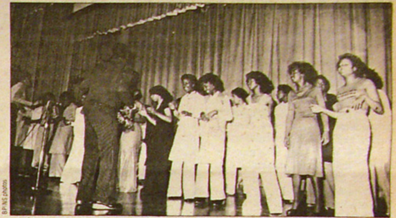
"Chocolate City" graduates performing at commencement exercises.

"I really enjoyed the play showing the Black experience, showing our African heritage. It