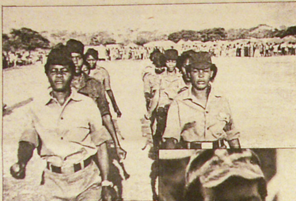
SWAPO women militants in training. SAM NUJOMA, SWAPO leader (inset).

The racist forces suffered such heavy losses that they began building a chain of support bases and they introduced the first Black soldiers, called "police" but trained as military. They began with South African Black recruits as it was virtually impossible to recruit Namibians. Only in the last two to three years have the South Africans begun recruiting Namibians.