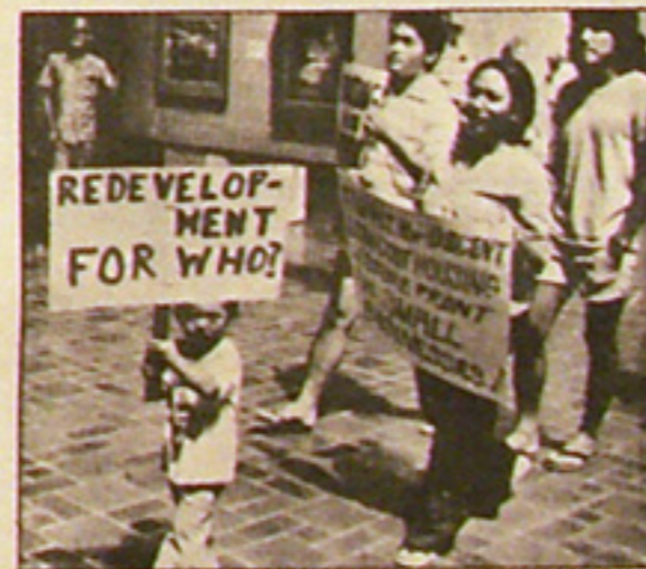
Honolulu Chinatown residents successfully protest against evictions of low-income people.

project. But the tenants refused to move, saying the city's relocation offers were inadequate.