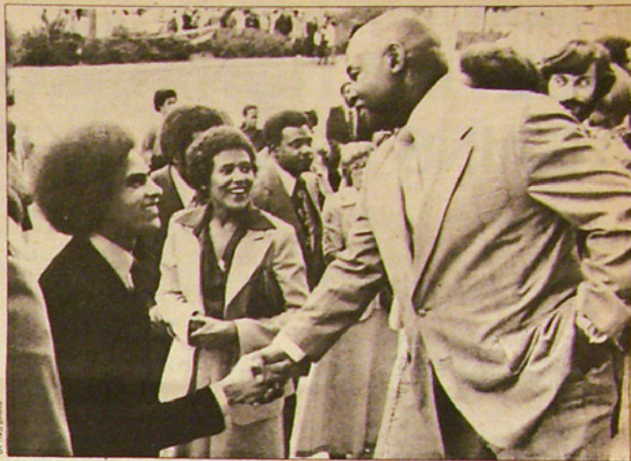
HUEY P. NEWTON and ELAINE BROWN at recent San Francisco reception featuring Tanzanian President Julius Nyerere.

(After the April 6, 1968, ambush of the Black Panthers by the police, in which Bobby Hutton died, Eldridge Cleaver was sent to Vacaville prison by the California Adult Authority for parole violation and other charges. He remained there for two months. Charles Garry petitioned for a writ of habeas corpus in the court of Solano County Superior Court