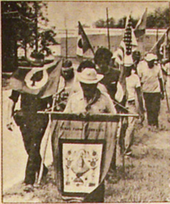
Texas farm workers are marching to Washington, D.C., to demand their human rights.