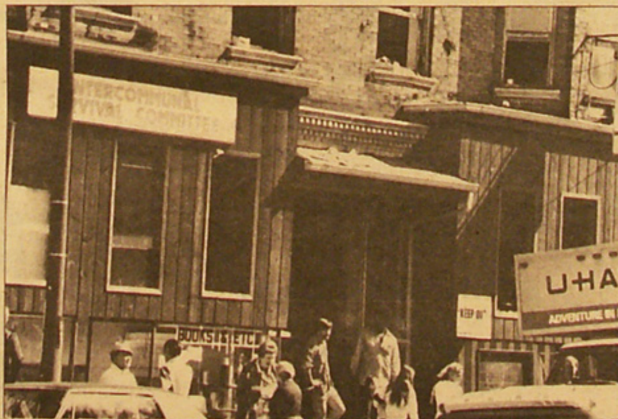
The ISC has called the burning of its office "another attack on progressive organizations working day-to-day... in this country for social change."

Until a new Chicago ISC office is established, anyone wishing to correspond with the ISC or its Committee for Justice for Huey P. Newton and the Black Panther Party may write to Keep Strong Publishing Company , 1222 W. Wilson, Chicago, Ill. 60640. □