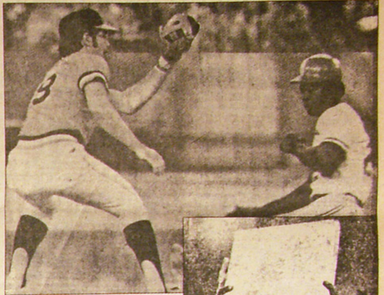
LOU BROCK holds up second base after tying Ty Cobb's stolen base record. Later on in the seventh inning of game Brock broke the record with his 893rd theft.

Brock, now in his 17th major league baseball season, has attempted 1,180 steals in 2,376 games, the Associated Press reports. He has stolen one base in every 2.7 games, getting caught 287 times for a 76.5 per cent success rate. So far this season, Brock has stolen 28 bases in 49 attempts.