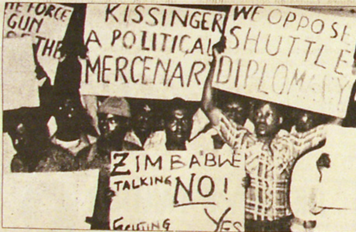
Tanzanian students protest 1976 visit to the East African country by former U.S. Secretary of State Henry Kissinger.

Mwalimu, or "Teacher," as he is known among the people of Tanzania, Nyerere went on to explain that while the "dignity" of France had been hurt by the protest signs, in France's mind, "The dignity of Africa is not hurt