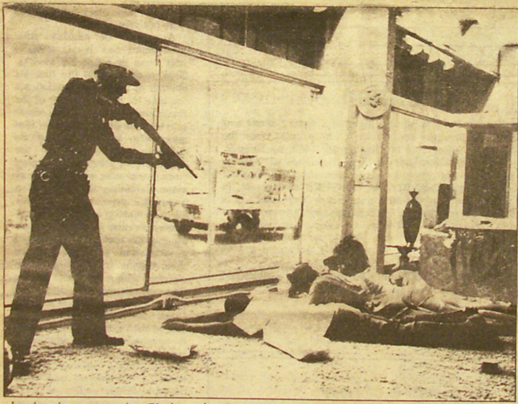
Los Angeles cop terrorizes Black people. Already this year, 27 people, the majority of them Black and poor, have been gunned down by the notorious Los Angeles Police Department. A broadbased coalition of Black organizations and individuals has filed suit against the LAPD, demanding full disclosure of all citizens' complaints against police personnel.

(Los Angeles, Calif.) - The infamous Los Angeles Police Department (LAPD), responsible for the murders of 27 people since January of this year, is under increasing attack from this city's Black and poor community — frequent victims of the murderous and vicious police attacks.