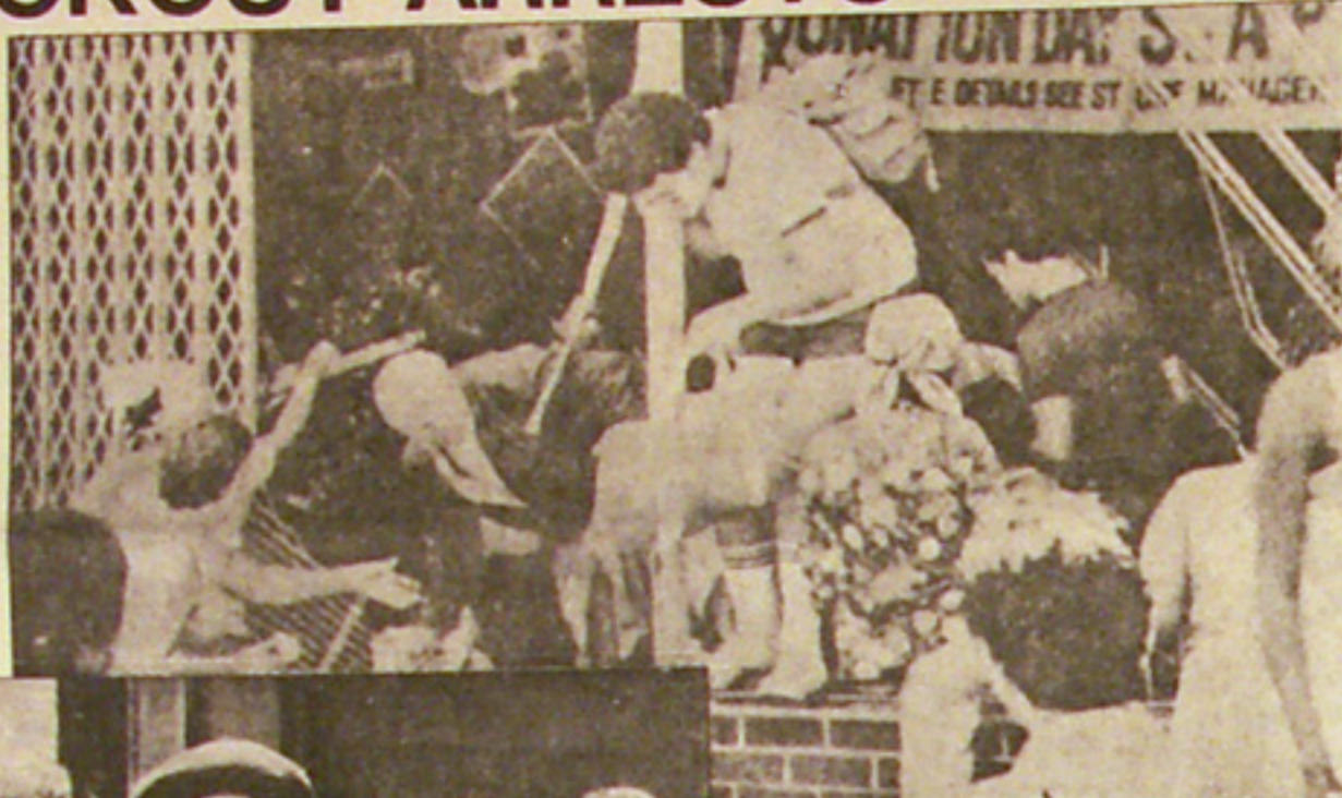
New York youth emptying store during recent blackout and (left) arrestees — there were 4,000 in all — being led from the notorious Tombs jail site.

(New York, N.Y.) - This appropriate comment was recently directed at racist New York