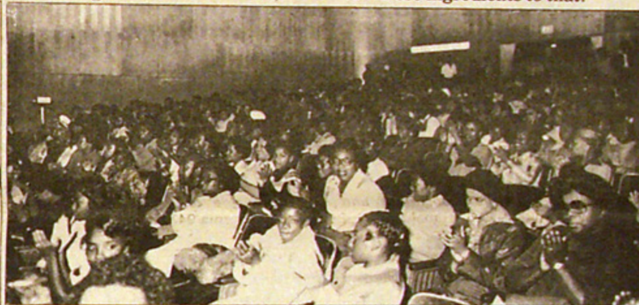
BPP President HUEY P. NEWTON was well received at Bayview-Hunters Point "Chocolate City" Graduation ceremonies.