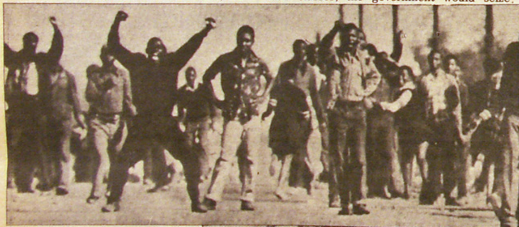
Militant Soweto youth openly confront South African apartheid (above) and South African police mercilessly beat Azanian women during protest against fascist Vorster regime. In an effort to quell continuous rebellions, the South African government has announced that it will take over the administration of schools in Soweto "township."

Black leaders point out that the Black education councils in Soweto have, in the past, been largely government-controlled and therefore, last week's announcement represents little or no change in how the schools will be administered. □