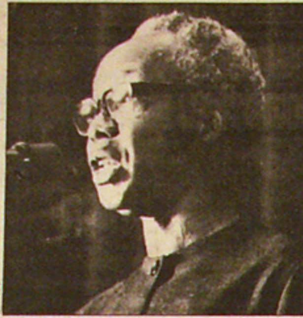
Tanzanian President JULIUS NYERERE.

Changes in the representation on major international economic institutions are not wanted for prestige purposes! The establishment of a link between development and the actions to counteract the economic power of the wealthy could be expected to follow. For the purpose of this demand for change is that the