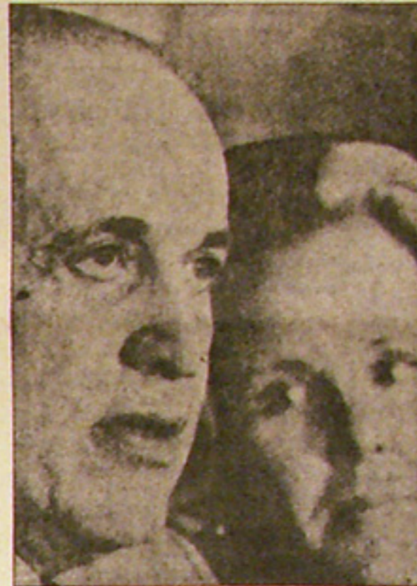
Convicted criminal, Governor MARVIN MANDEL with his wife.