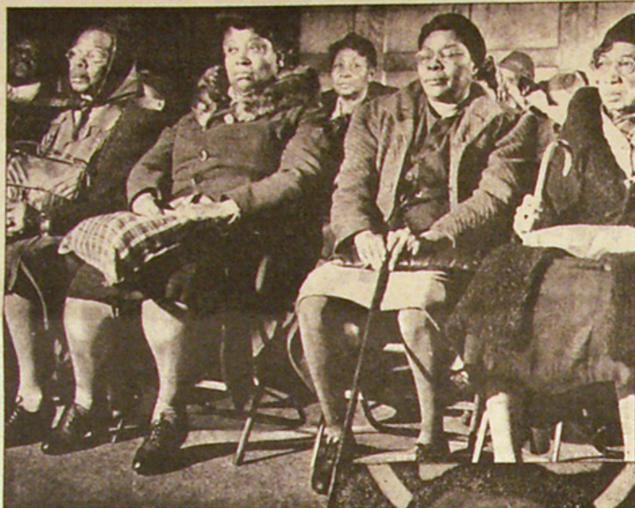
Urban League Director VERNON JORDAN has criticized the Carter administration for ignoring campaign pledges to the poor.

Tied to a revamped tax system that eliminates the billions of dollars in loopholes and tax preferences, such a system would