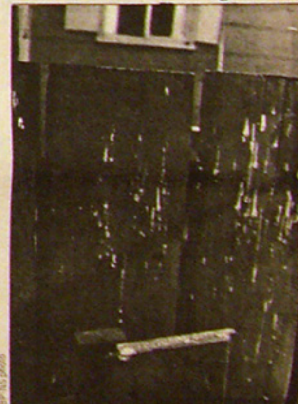
Holes left in fence from .00 buckshot fired at Oakland Black man by San Leandro police.

Due to fear and intimidation of residents in the area, THE