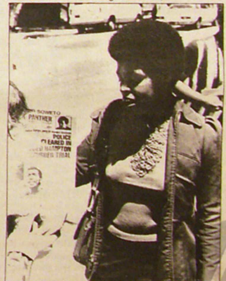
INTERCOMMUNAL NEWS SERVICE

Provides 24-hour child care facilities for infants and children between the ages of 2 months and three years. Youth are engaged in a scientific program to develop their physical and mental facilities at the earliest ages.