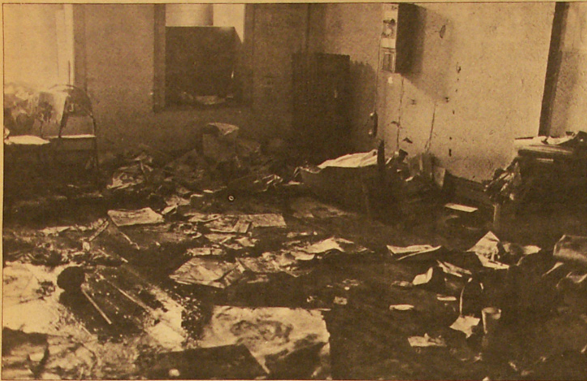
Chicago ISC "Justice For Huey" headquarters after it was burned by arsonists last week.