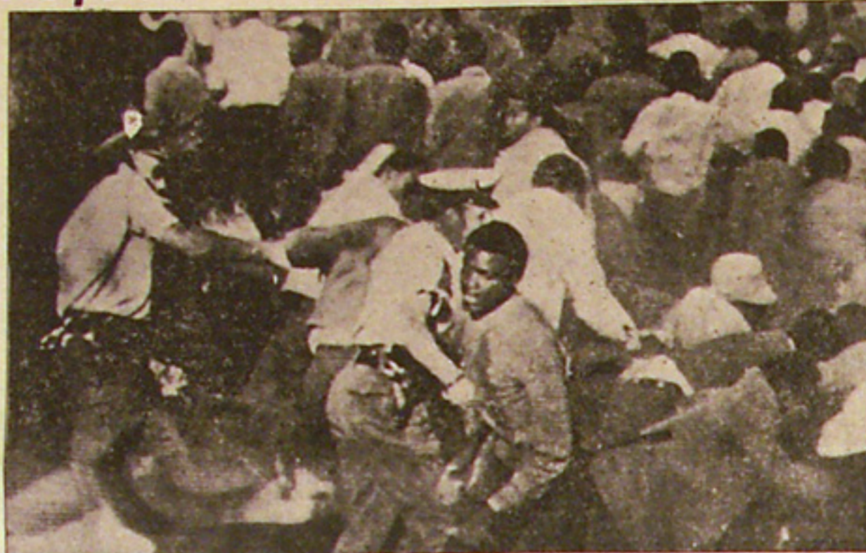
Rhodesian police forcefully disperse Zimbabweans protesting against White minority rule.

"We support any initiative so long as it is sincere and is