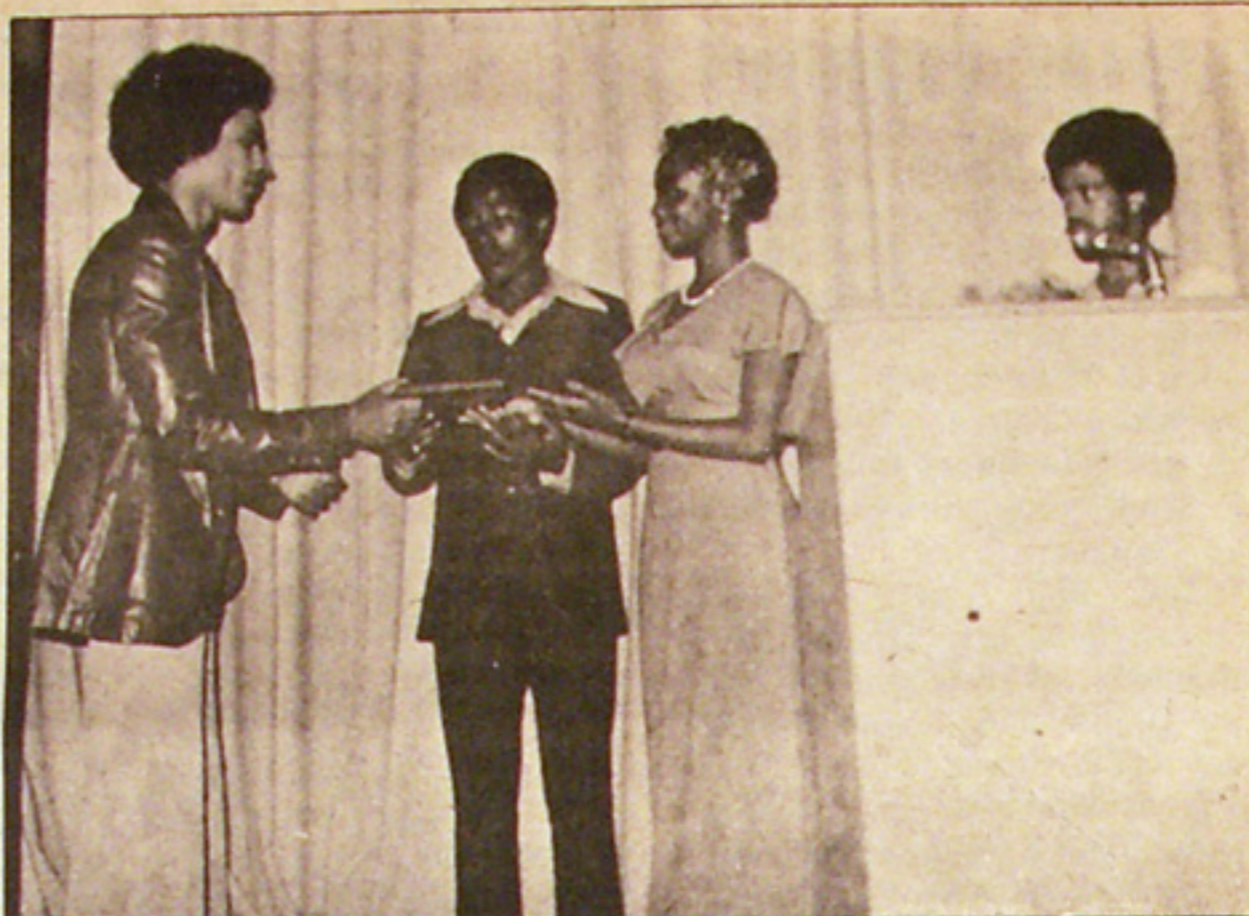
HUEY P. NEWTON receives plaque of appreciation from "Chocolate City" graduates.