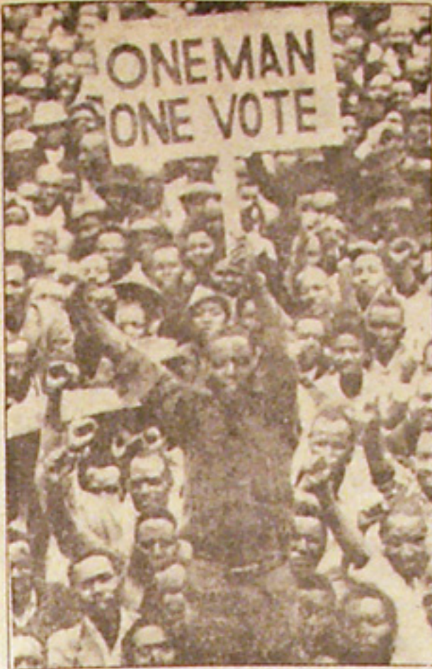
Zimbabwean protest demanding Black majority rule.

Officials of the Smith government indicated last week that