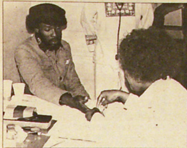
GEORGE JACKSON MEDICAL CLINIC

"All these programs satisfy the deep needs of the community but they are not solutions to our problems. That is why we call them survival programs, meaning survival pending revolution." — Huey P. Newton