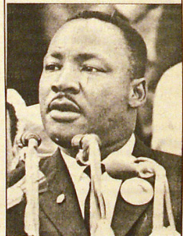
MARTIN LUTHER KING, JR., addressing 1963 March on Washington.

Congress passed the Civil Rights Act of 1957 on August 29, 1957, the first federal civil rights legislation enacted since 1875.